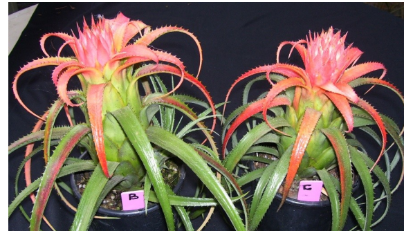
Aechmea 'Blush' and Aechmea 'Cardinalis'

Reading here about true to type seed pollinating and seed growing reminded me of Keryn's Aechmea recurvata and an issue raised during the month. I was asked if I knew of a plant named Ae. recurvata 'Buchanans Black', there was an accompanying photo which reminded me of two plants we dealt with in 2011. These were Ae. 'Blush' supposedly Ae. recurvata x Ae. orlandiana but grows true from seed, cross not achieved, the second was Ae. 'Cardinalis' , both these plants look very much alike. There is no record of a 'Buchanans Black' in the record books at PineGrove. Fortunately a well known Northern NSW grower owned up admitting she bought a recurvata from June Buchanan many years ago, when wanting to sell some at a Gold Coast Society meeting she named it 'Buchanans Black' due to its black seed pods. It's a good lesson on not to adopt a "pet name" or nickname of a particular cultivar/clone without registering it after consulting the source, the breeder and / or supplier, as it may be registered later with a different name for the same clone -- see Ae. 'Blush' on the BCR in this case. If by chance any readers have a Ae. recurvata in their collection or know of one tagged as 'Buchanans Black' change it to Aechmea 'Blush' .