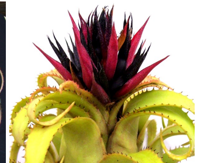
Black seed pods giving it "the pet name"