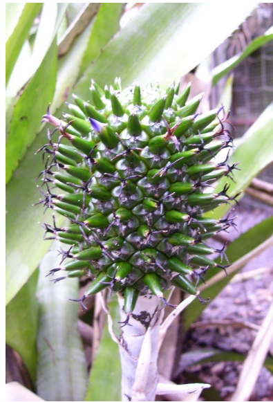
Aechmea muricata grown by Ross Little

First time flowering for me of this plant that I've had for more years than I care to remember. I planted it in a newly developed garden we built here at PineGrove at least 12 years ago and it has finally rewarded us with its flowering. The blue petals only seem to appear at night which makes it difficult for me to capture open flowers which have no scent/perfume of note. They are a relatively large plant growing to over a metre across with broad stiff leaves and armed with strong spines. The spike is 600mm high including the 100mm x 80mm cylindrical inflorescence. Aechmea muricata has been around in collections in Australia since before the early 1980s hence I'm surprised I had not seen it flowering before.