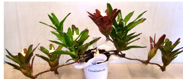
Our Decorative section was all lit up this month with this mini Neoregelia, to complete the candelabrum Drew Maywald wired it up with lights.