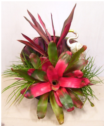
'Rays of Pink' shown by Keryn Simpson