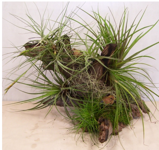
'Birds on the Tillandsia Stump' shown by Helen Clewett