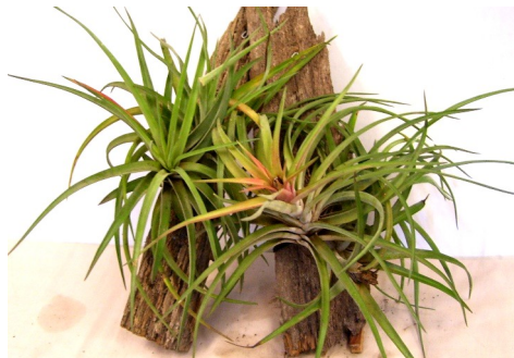
Tillandsia velutina ID'd for Keryn Simpson